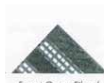
Forest Green Fiber/ Forest Green Vinyl