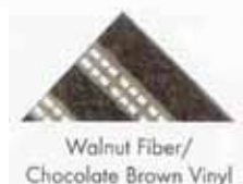
Walnut Fiber/ Chocolate Brown Vinyl