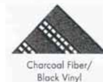
Charcoal Fiber/ Black Vinyl